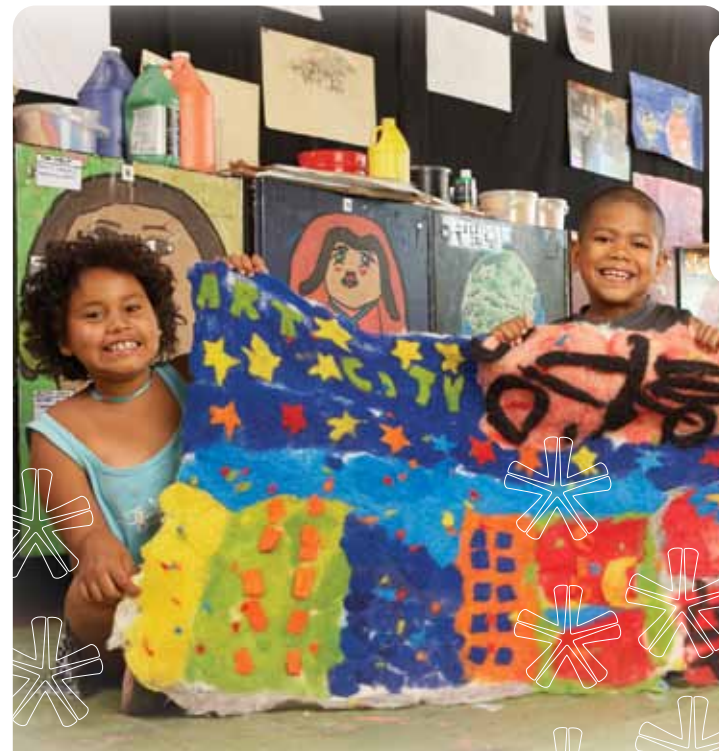
Artwork created by Art City Participants

Like you, we believe great things can be achieved when people with similar values work towards common goals. If being part of a co-operative that is both profitable and compassionate appeals to you, talk to us.